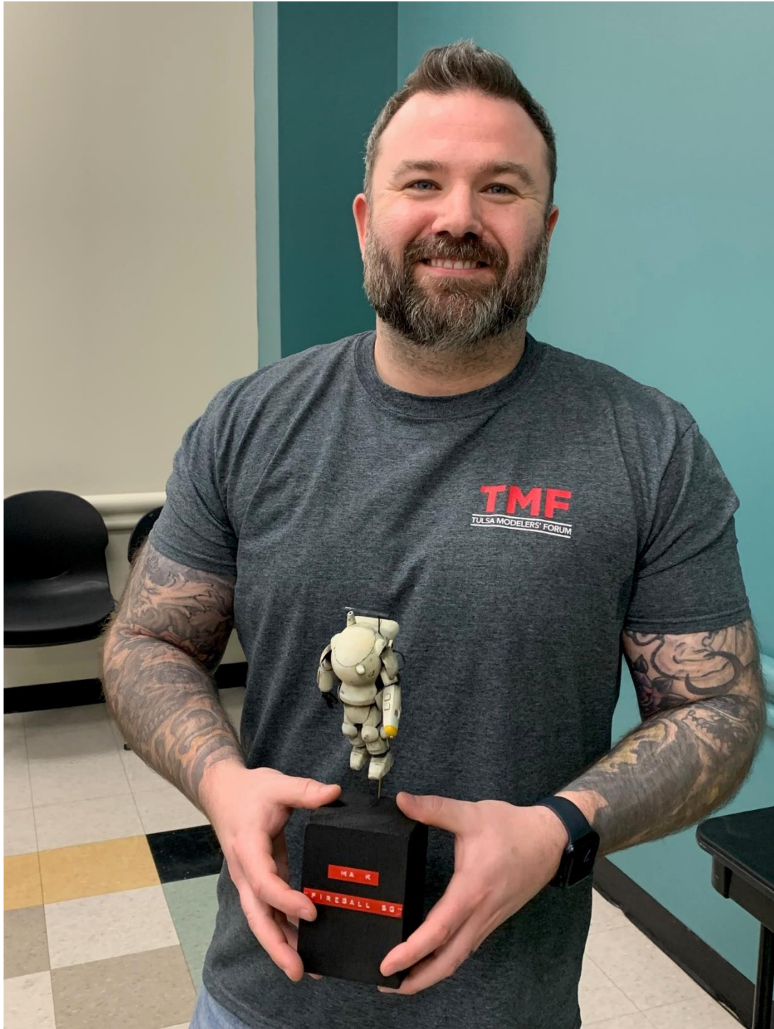
December Model of The Month!!